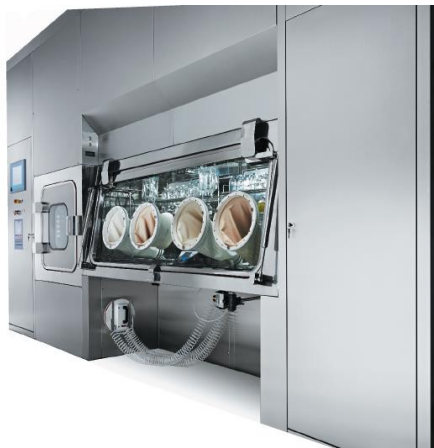
Fig. 3– General view of a Sterility Test Isolator

most popular: its antibacterial, antimycotic and antiviral properties are well known and scientifically documented. The effectiveness of the treatment depends both on the overall concentration and on the even distribution of the hydrogen peroxide inside the isolator. In order to vaporize the hydrogen peroxide before dispersing it into the working space of the isolator, a controlled amount of liquid peroxide is sprayed onto a heated plate above which an air stream is flowing. In the isolators manufactured by Fedegari, one or more circulation fans are installed in the ceiling of in the working space to obtain an even distribution of the sterilant and sporicidal agent.